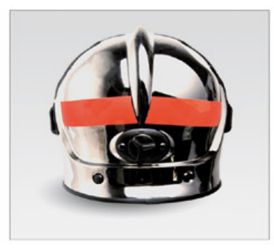
Reflective tapes Silver