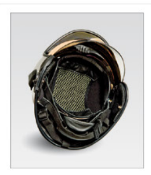
Adjustable antistatic net cradle