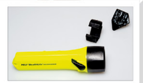
Torch holders support (detachable)