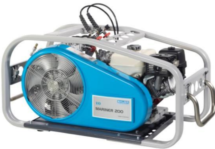
MARINER200-B standard version