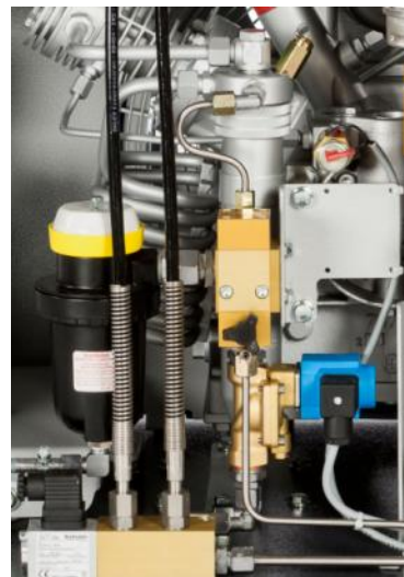
Automatic condensate drain system

For petrol version, the automatic condensate drain system is supplied without control!