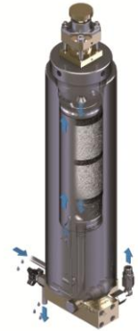
Purification System P31/350