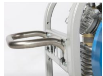
Crash frame incl. handles

The corrosion-resistant crash frame provides additional protection for the unit and can accommodate additional accessories such as a compressor control or a larger filter system. The handles make moving the unit easy and convenient.