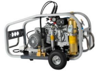
MARINER-E with trolley

The trolley provides an easy and convenient mode of transport for mobile compressor units. Fitted with pneumatic tires, the trolley maximizes mobility.