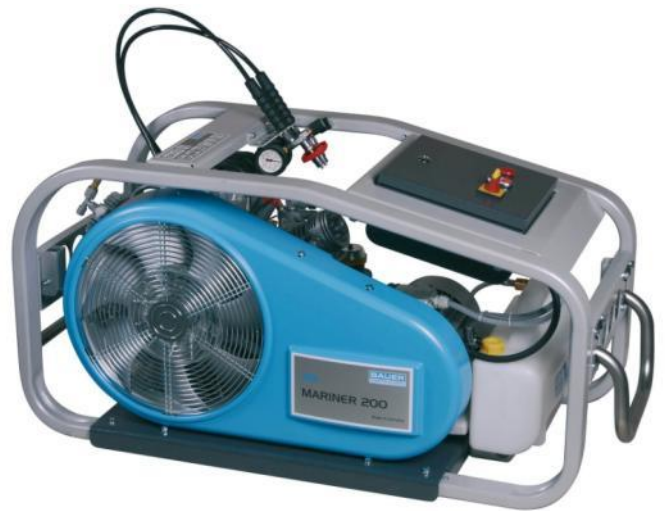
MARINER200-E with optional equipment