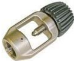
International filling connector