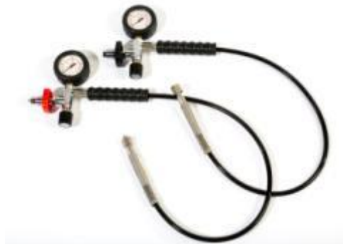
Filling device PN200 (black) and PN300 (red)