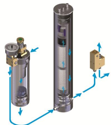
P 41 purification system (picture similar)