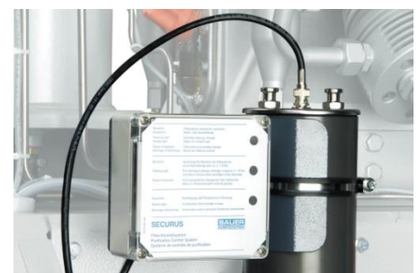
B-SECURUS Filter Cartridge Monitoring System

Only available with P 41 and only for MARINER200-E!